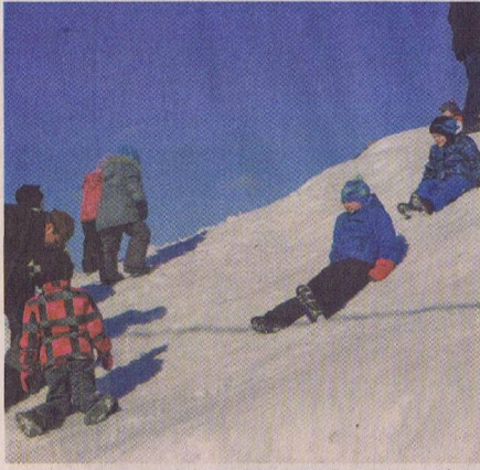
Sliding down a huge snow mound located in back of the E. and P. Sénéchal Centre proved to be very popular with kids. Whether it was with a sled or by the seat of their snow pants, it was one of the many activities held during Frost Day on Saturday.