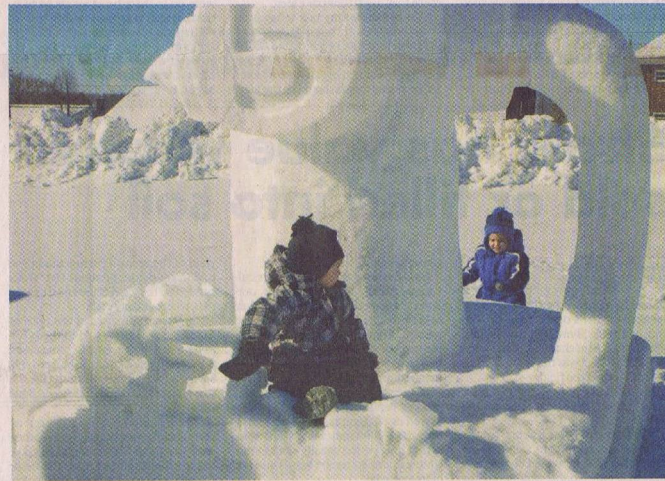
Youngsters have fun on the fire hydrant snow sculpture created by the Grand Falls Fire Department on Broadway Boulevard during Frost Day held on Saturday.