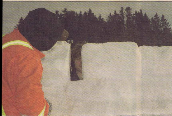
Lining up As one member of the Gemtec team looks on, a teammate casts a glance to make sure both snow blocks will line up perfectly. The Gemtec team was one of 10 teams which participated in the igloo building competition held Feb. 16-18 in Grand Falls.