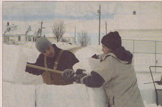
Hard at work Members of the Brun-way team were working hard on Saturday, February 17 during the igloo building competition held in Grand Falls. The event, sponsored by the Northwest Branch of the New Brunswick Association of Professional Engineers and Geoscientists, attracted 10 teams. It was one of the many activities held in conjunction with the Town of Grand Falls' Winter Carnival.