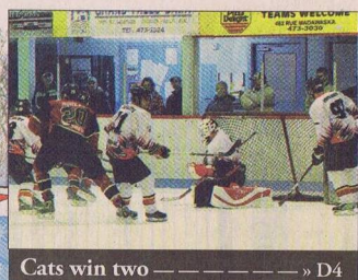
Cats win two ————— » D4