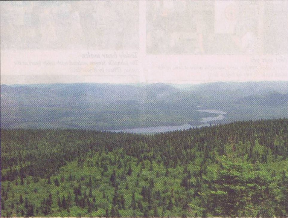
The view is worth it An unspoiled landscape of verdant green forest and crystal blue waters lies below Mount Carleton.

"We are going to do that next year!" daughter Pam stated.